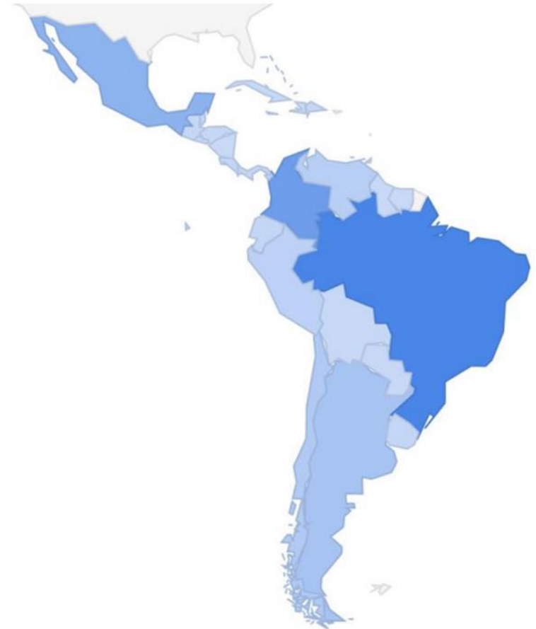
Figure 51 - Domain name registrations across the region (ccTLD data from registry survey; gTLD data from WHOIS analysis)